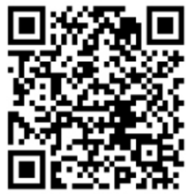
School Health Nurse Contact Form

You'll need to be logged in to your Education account to access the form.