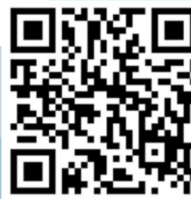
Student self-referral for Newstead College Wellbeing Team